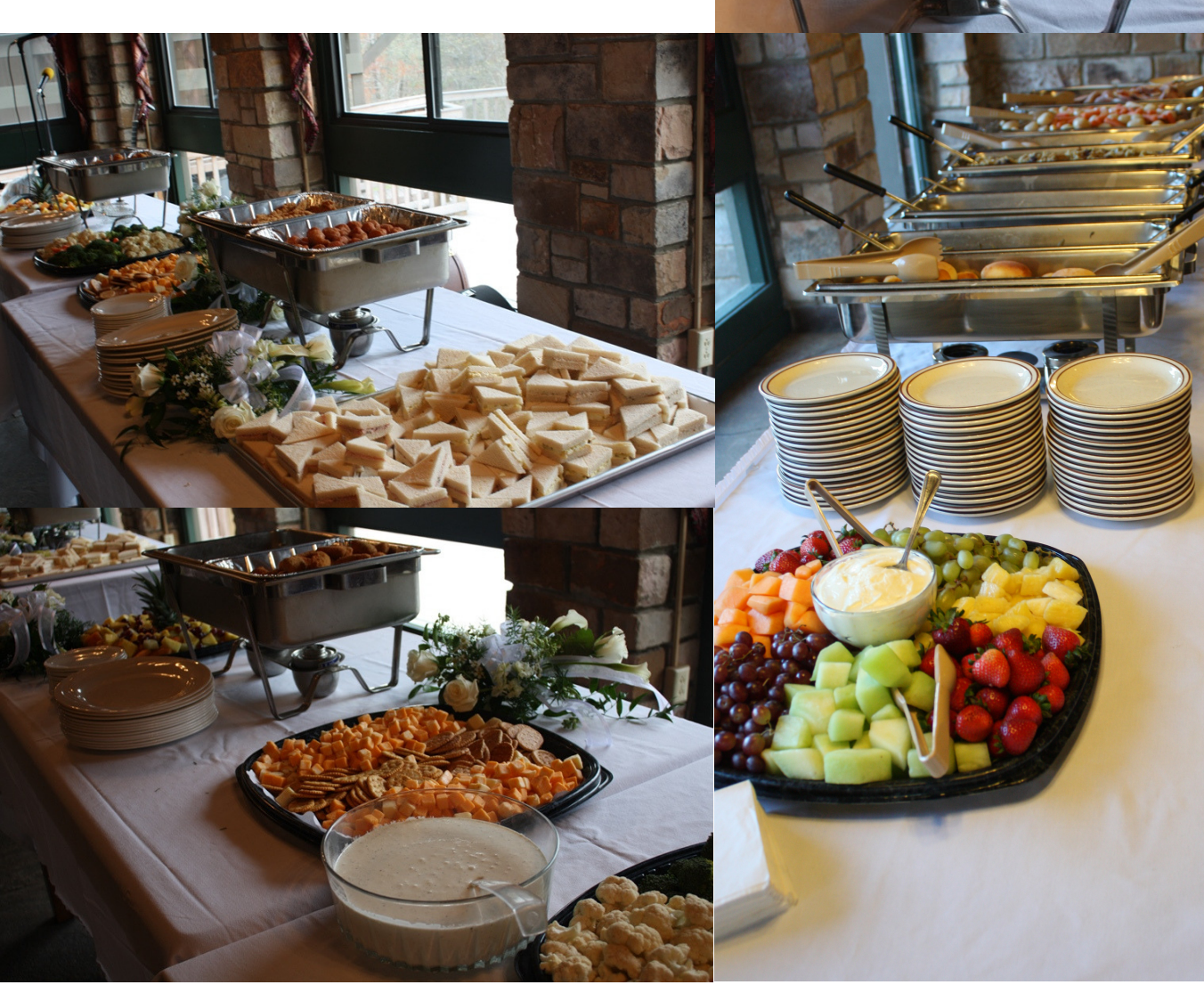
*All Prices Subject to change without notice, subject to 9% sales tax & 20% Gratuity *All Buffets include full salad bar, freshly baked dinner rolls, coffee or tea