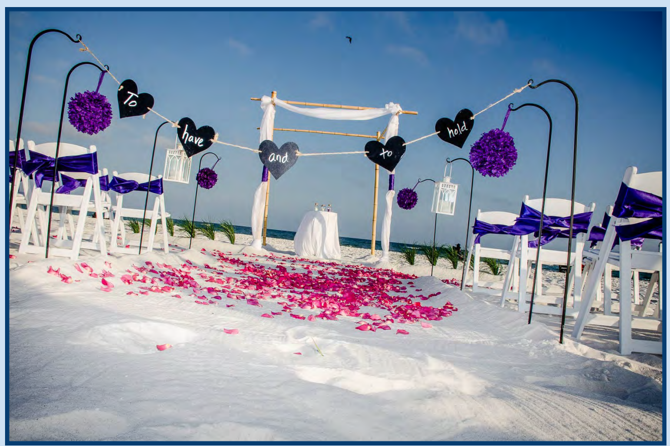
AT THE BEACH WEDDINGS